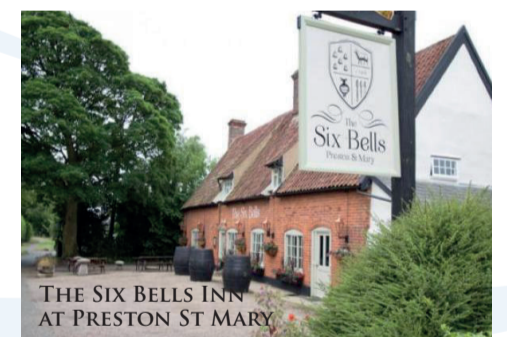
THE SIX BELLS INN AT PRESTON ST MARY

At the next footpath junction, continue straight ahead, and follow path to the next road. Turn right and walk along the road (Church Lane)