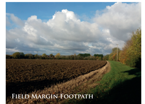
FIELD MARGIN FOOTPATH

the hedgerow and ditch now on your right hand side. Continue along this path, which crosses via a small wooden footbridge to the other side of the margin, until you reach a road. Cross the road (take care), continuing along the